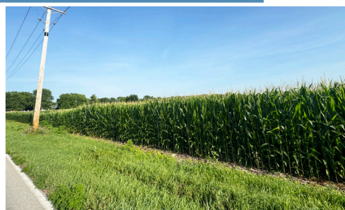
PICTURED: View looking southeast.