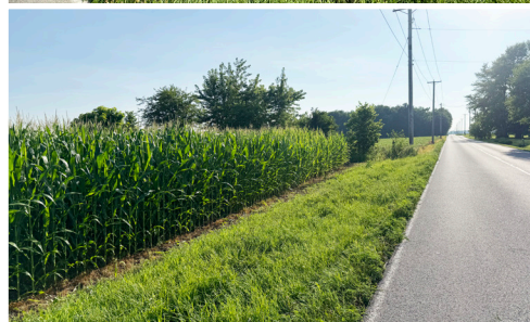
PICTURED: View along CR 950 S