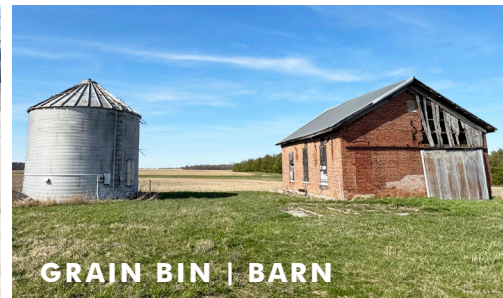
GRAIN BIN | BARN