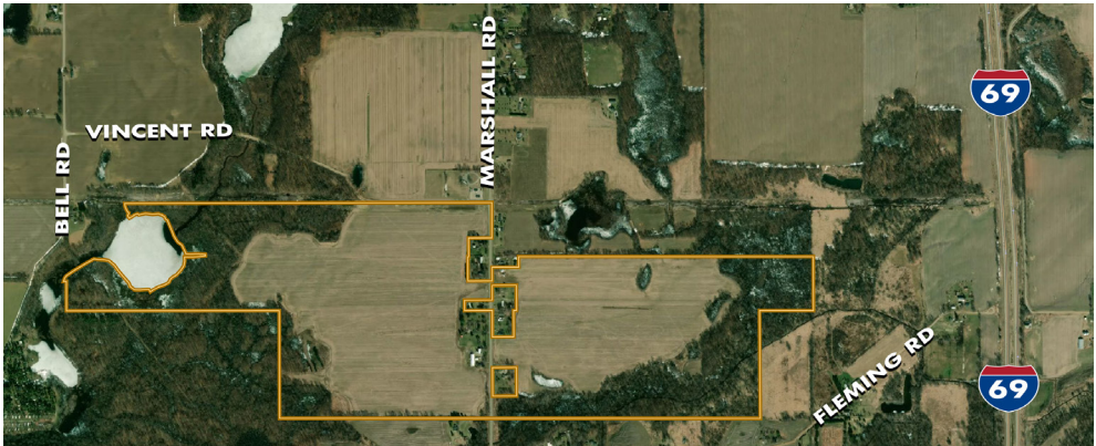
Additional information including photos and a drone flight are available at halderman.com.