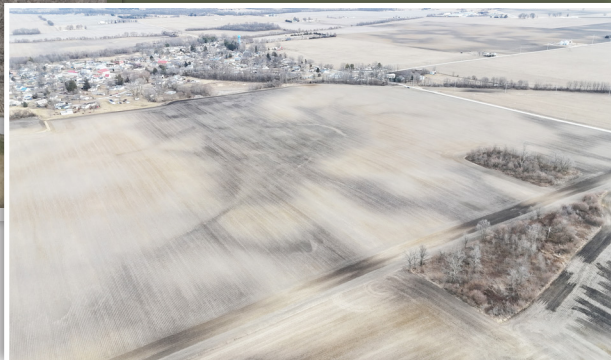
Tract 1 is pictured above and Tract 2 is pictured in the background behind the mailing label.

125.79+/- ACRES • 2 TRACTS • TILLABLE LAURAMIE TWP • TIPPECANOE CO, IN