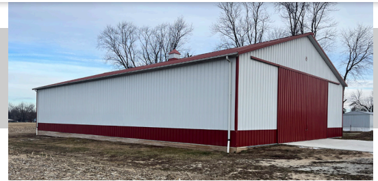
60x100 Machine Shed with concrete floor