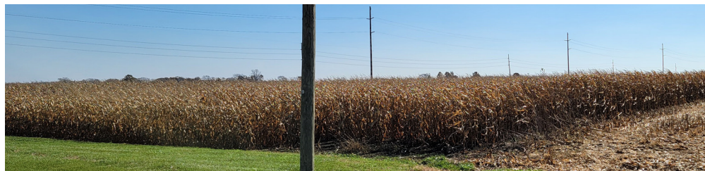
ROAD FRONTAGE • OLDER FLAT BARN

View additional photos and information regarding this listing.