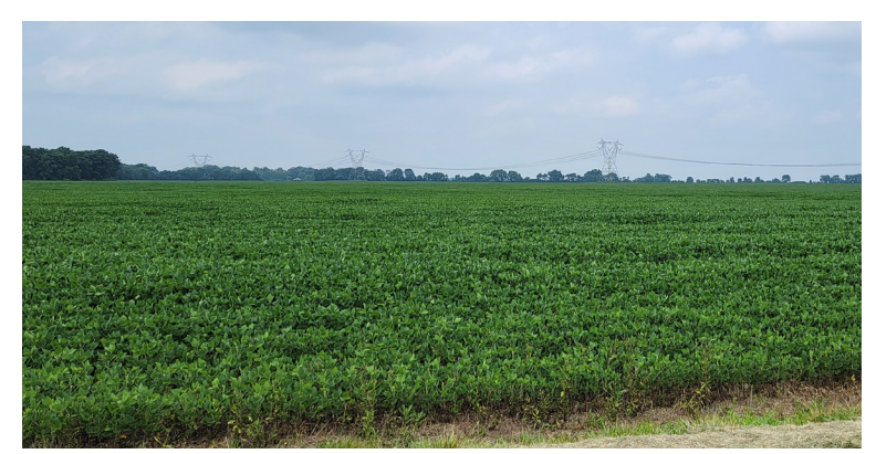
TRACT 1: 71.2 +/- ACRES 61+/- Tillable • 8.5+/- Woods • 1.7+/- Other