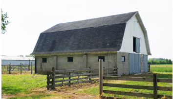
32' X 40' BLOCK BARN