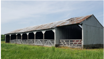
OPEN FRONT LIVESTOCK SHED