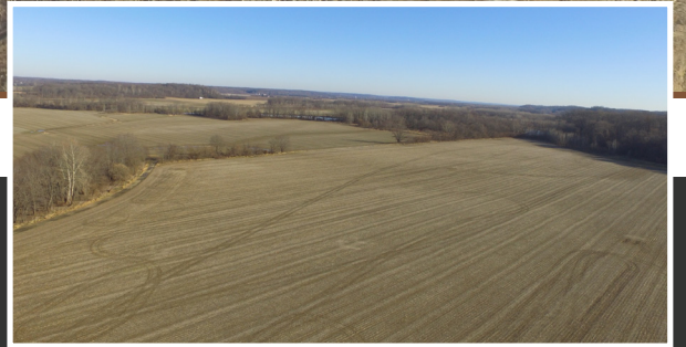
LOOKING OVER N MOON ROAD

AUCTION CONDUCTED BY: RUSSELL D. HARMEYER, IN Auct. Lic. #AU10000277, HRES IN Lic. #AC69200019