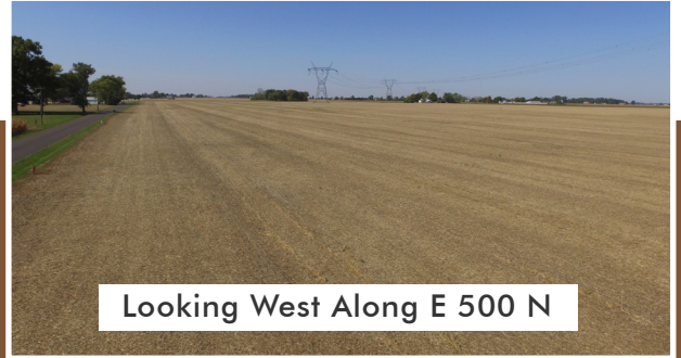
Looking West Along E 500 N