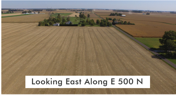
Looking East Along E 500 N

GOOD FARMLAND • 6 MILES NORTHWEST OF GREENTOWN, IN